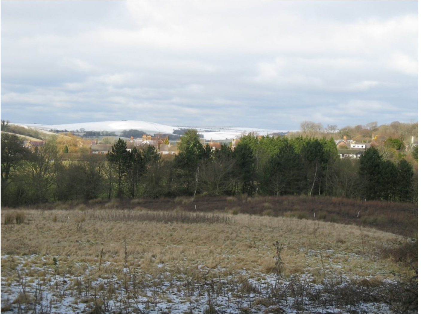
View to Blackpatch Hill from Clapham Common (S.Morris)