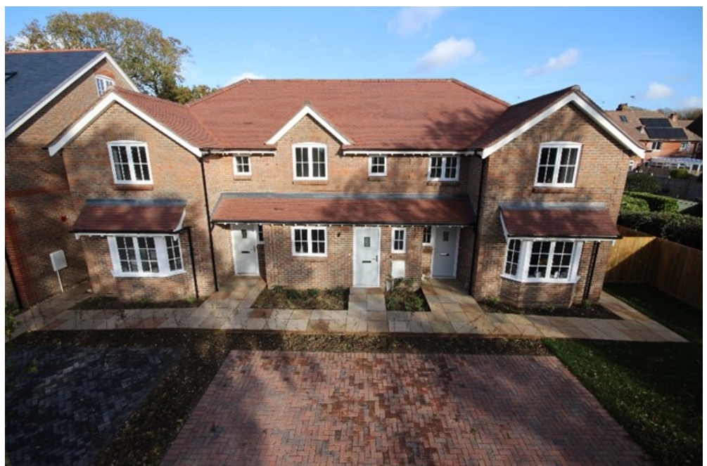
Brickyard Cottages (Cooper Adams)

While there was no insistence from residents on the use of traditional construction materials for new buildings, a nod to the appearance of surrounding buildings was felt to be highly appropriate. The new development at 'Brickyard Cottages', just south of Clapham Common, is a good example of how the tasteful use of brick can reflect, without directly imitating, the predominant local style of the adjacent settlement.