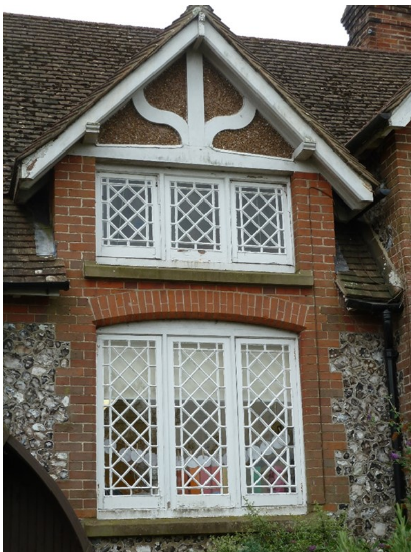
Window detail, Clapham School (S.Morris)

The attractive Victorian building of Clapham & Patching C of E School dominates the entrance to the village; the building has been listed as an Asset of Community Value.