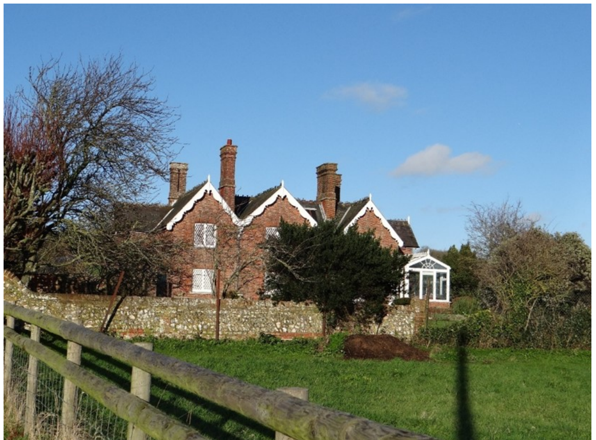
Holt Farm House (C.Tomkins)

A public footpath runs from the eastern end of Clapham Street across the fields to the westernmost unmade lane, and then on the other side to Holt Farm House. The westernmost lane also continues northwards, as a public footpath and bridleway through the woods; it intersects with 'Grub Ride', which bisects Clapham Wood from West to East, and continues north to the brow of the ridge above the east-west section of the Long Furlong; the track crosses the Findon Parish boundary shortly before leaving the woods.