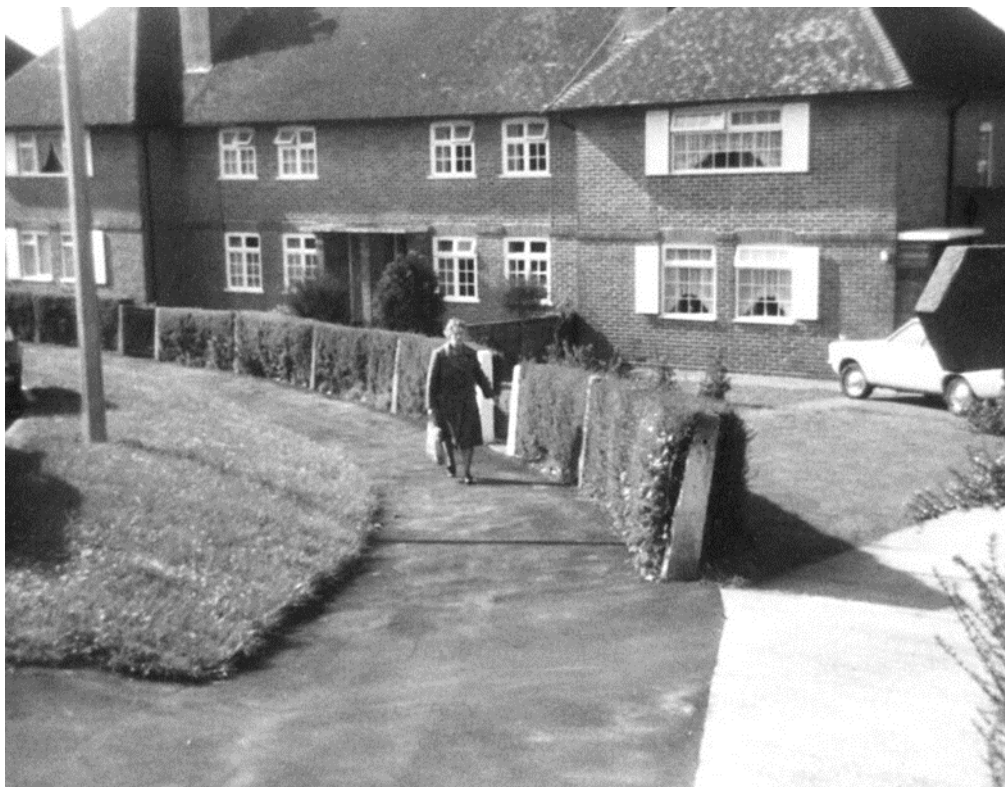
Houses in Clapham Common (Friends of Clapham & Patching Churches)

The 5 dwellings of Brickyard Cottages are accessed by an entrance directly off the A280 just to the south of Brickworks Lane. All but one of the houses (and a light industrial business park) on the A280 between Brickworks Lane and The Street are accessed via a section of the old road, which branches off the modern road opposite the Village Hall.