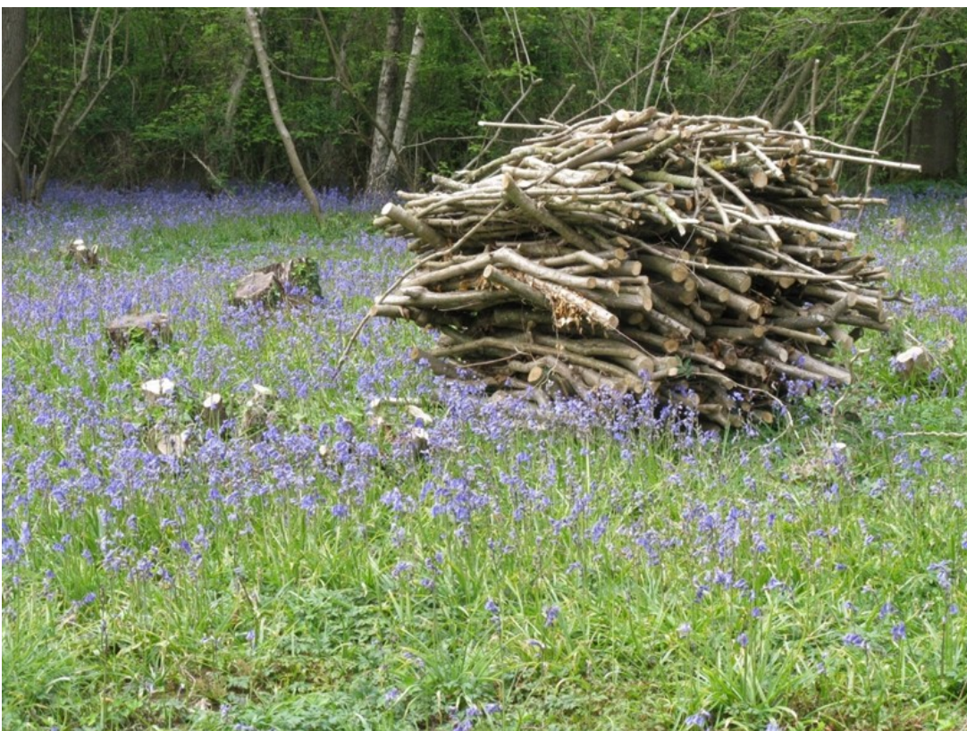
Coppicing and bluebells, Clapham Woods (S.Morris)

A detailed analysis of the feedback received from both the CNDP survey and the CPDS consultations will be found in Appendix 5.2.