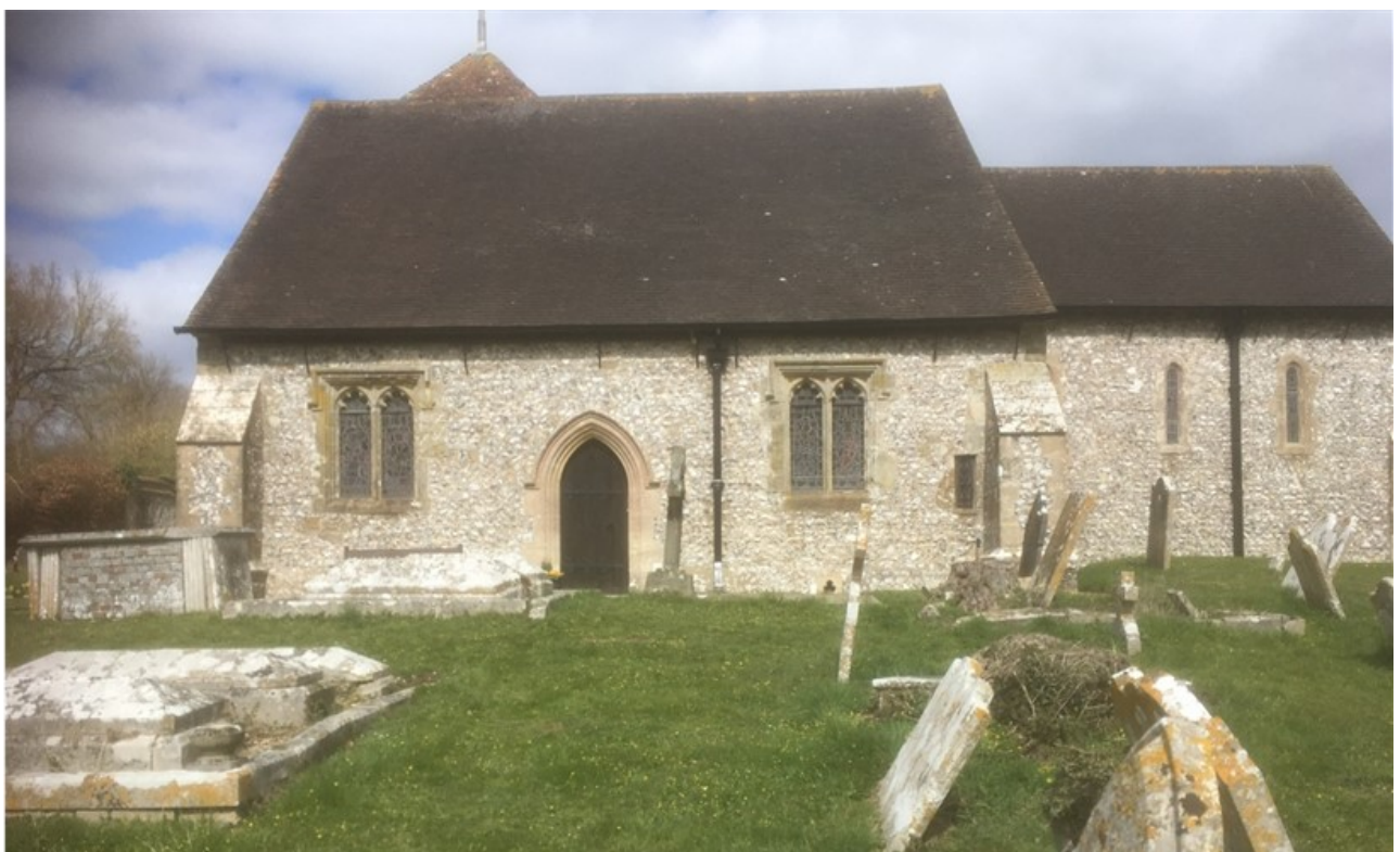
Clapham Church (J.Jeffers)

To the north, Church House (with its interesting outbuildings) and the recently restored Tudor Barn, with its farm buildings, form an attractive slightly separated cluster.