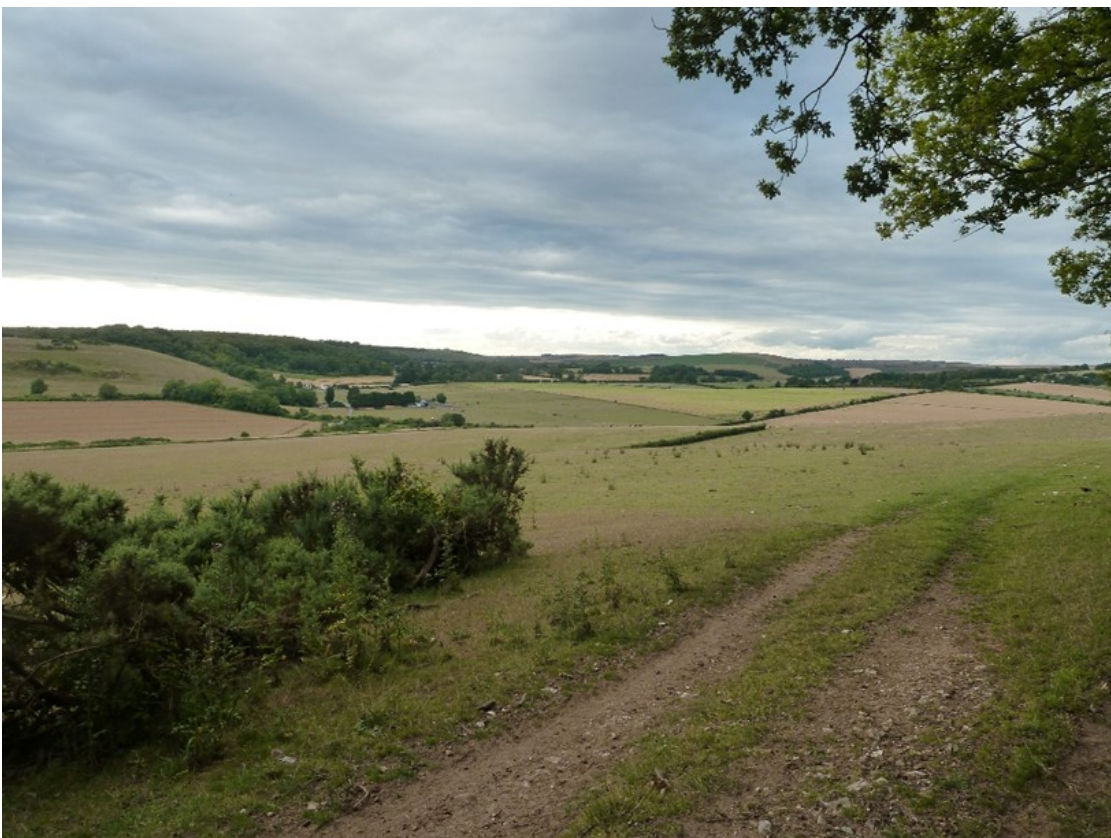
View northwards from the top of Clapham Woods (J.Morris)

The natural drainage pond outside the entrance to Shutters is one of very few examples of permanent water within Clapham. This is probably very significant for wildlife within the area.