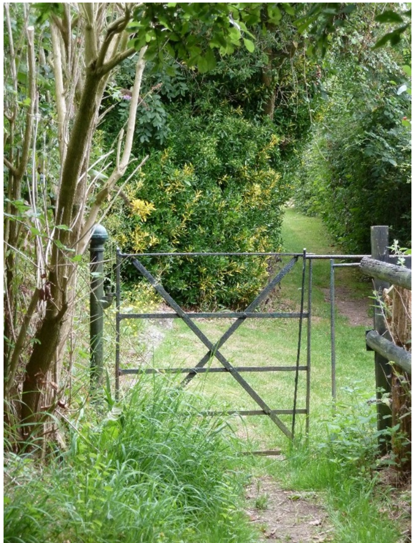
Public footpath parallel to The Street (S.Morris)

The Street is crossed, about 2/3 of the way from the A280, by Church Lane running north and Rectory Lane running south. Church Lane leads past Church Close to the Church of St Mary the Virgin, Church House, and Tudor Barn; Rectory Lane leads to a low former agricultural building now converted into the attached dwellings of Summerfold and Springbourne, and in the field beyond there are various agricultural buildings including the remains of a piggery. Both Church Lane and Rectory Lane are public footpaths along private roads. A further public footpath runs south of and parallel to The Street between Rectory Lane and the A280; another continues the line of Rectory Lane across the field beyond, to The Harehams and thence to Clapham Common woods and the settlement of Clapham Common.