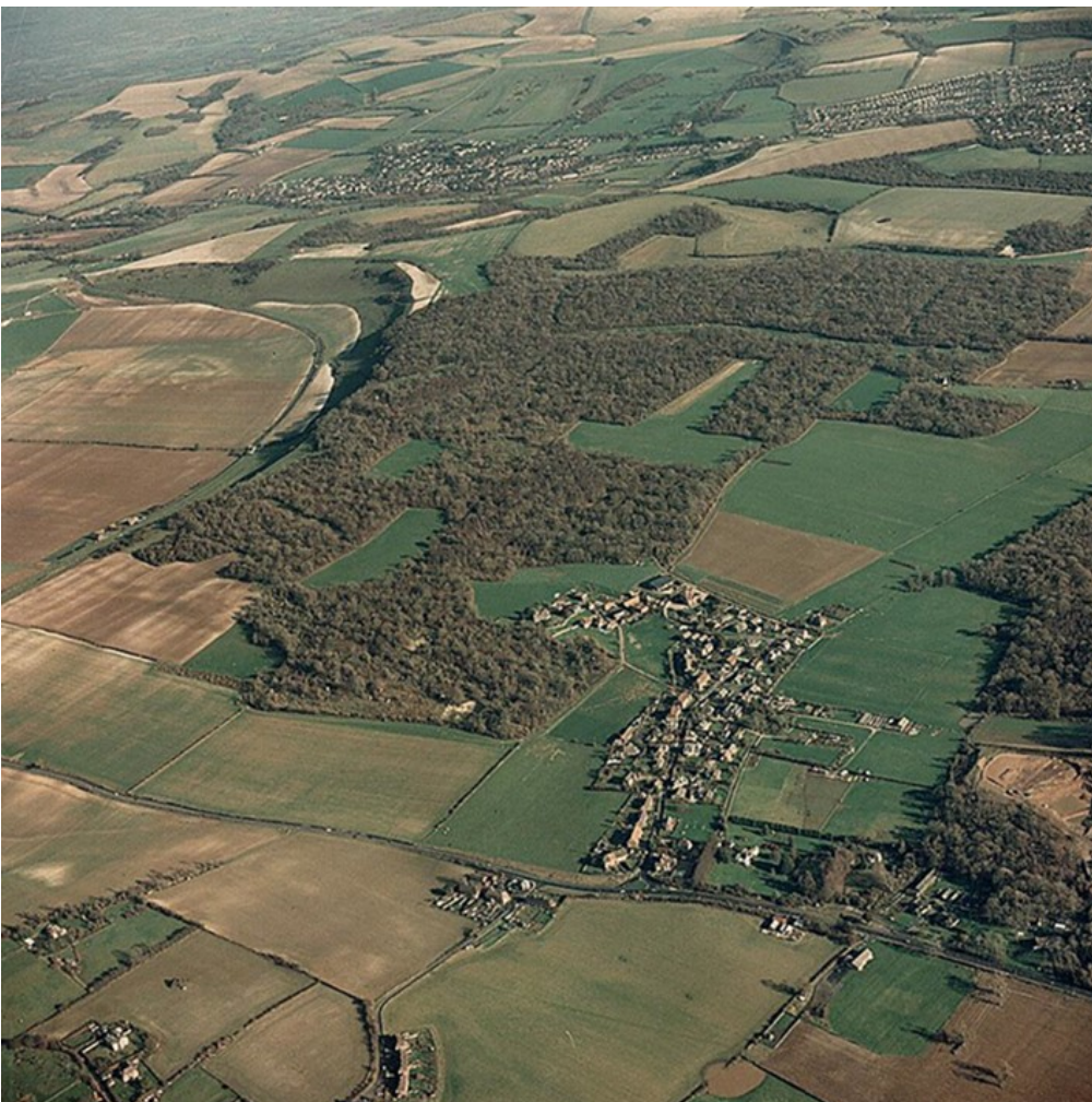
Aerial view of Clapham

The idea is not to limit development to a specific style – after all, Clapham has changed throughout its history, with new types of building to meet new needs. Instead, we hope to ensure that the character of the Parish, and its relationship to its lovely rural setting, is positively enhanced by any new buildings. This should mean that planning applications have the best possible chance of being accepted first time around, or that changes proposed under ‘Permitted Development’ are well supported.