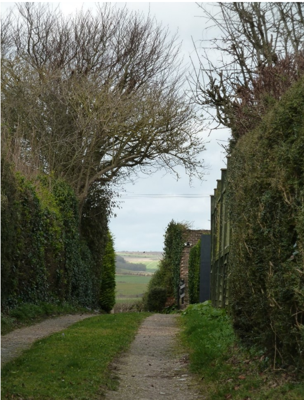
Glimpse of the Downs from The Street

From the western end of The Street, northerly views extend to Blackpatch Hill and the rolling downs beyond. Looking west, one looks across the dry valley to the woodlands beyond Patching village. From the eastern end of the village, there are views eastward across the fields to Holt; from further up the foot-path, one can see across to Worthing and the sea beyond. Many of these views can be enjoyed not only from and between individual houses, but also along the lanes leading between them. The rural views are greatly valued by residents.