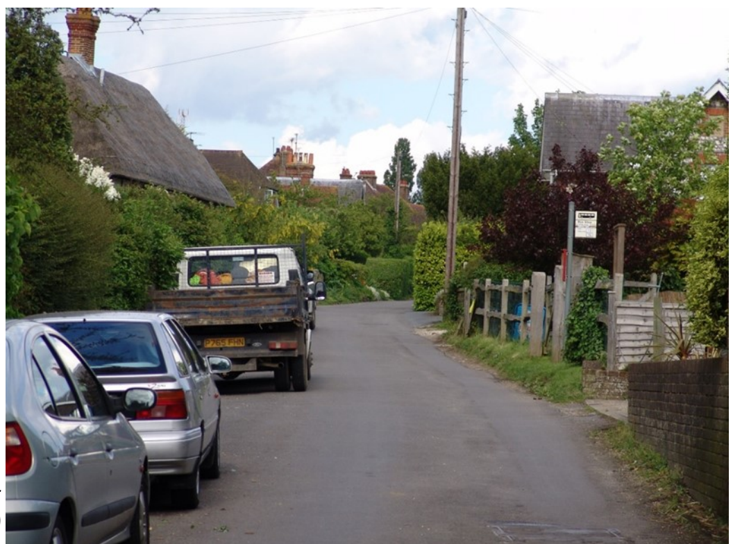
Parking in The Street (C.Tomkins)

Parking in both Clapham Common and The Street is an intractable problem, occasionally making the roads impassable to emergency vehicles, although it has been argued that parked cars have the effect of slowing down traffic, particularly in The Street. Possible traffic calming measures are under consideration by the Parish Council.