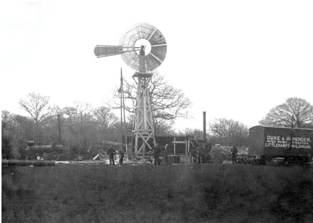
Wind pump in the 1930s