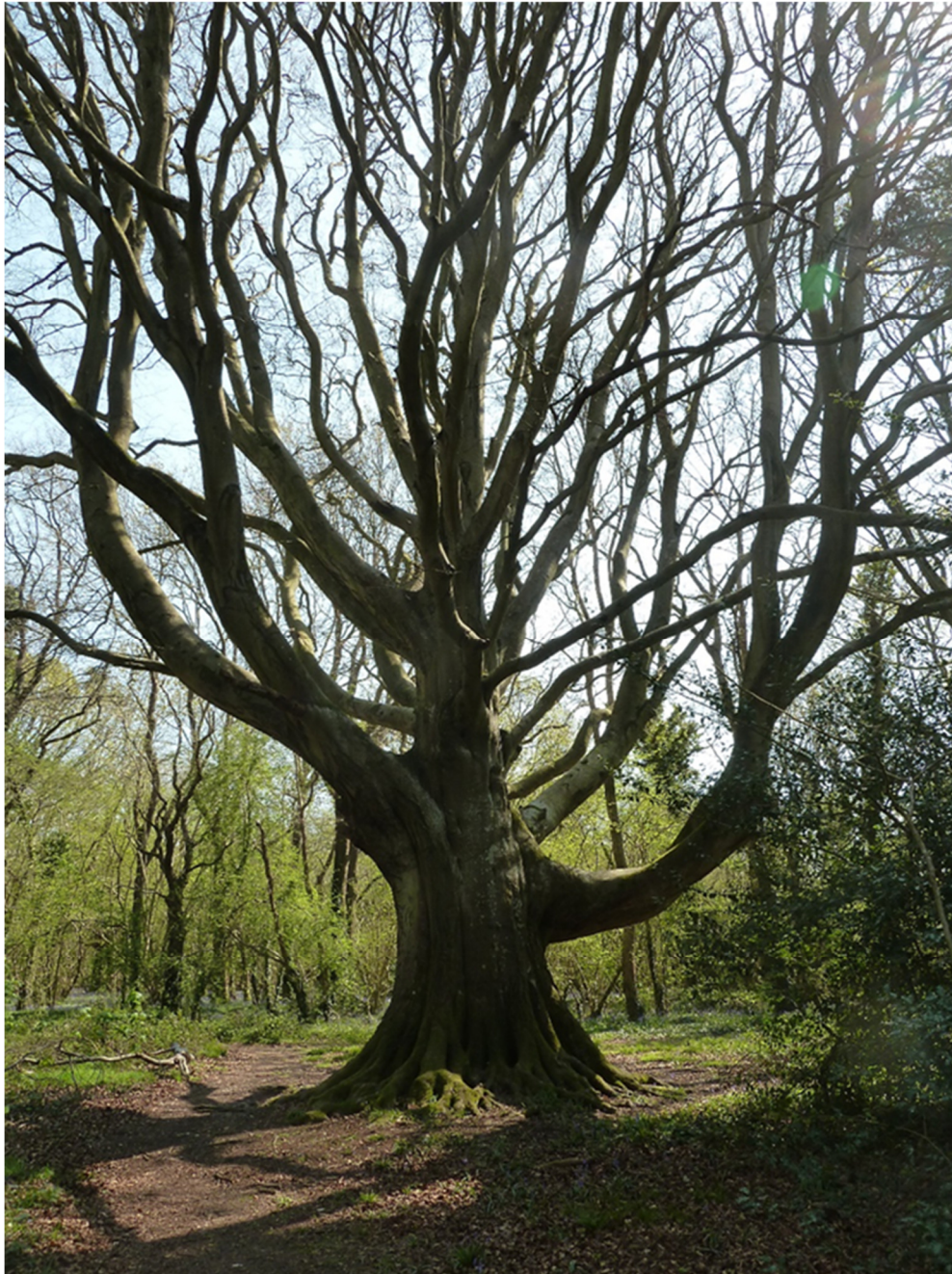
Ancient beech tree

Roe deer, foxes and badgers are all present in the woods; Roman Dormice are also found there, and are carefully monitored. Rabbits and the occasional hare are also seen in the fields. There are many species of both resident and migrating birds (more than 50 have been recorded from a single garden). An increasing raptor population, including Buzzard and Red Kite, suggests that there is a well-stocked food chain. Butterflies are also abundant, including such species as White Admiral. Less happily, bee-keepers report increasing mortality and colony failure; this may be connected with the insecticides used by farmers.