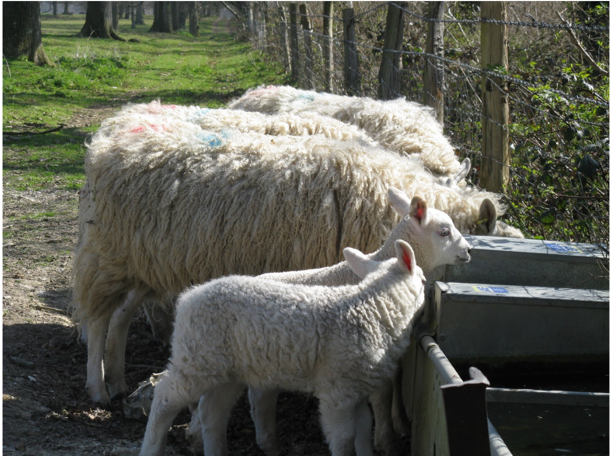
Sheep in Strawberry Field

western end of this chalk band. At the southern edge of the parish, a layer of geologically-recent deposits (clays, sands and gravels) forms a low ridge, the western end of which is the site of the hamlet of Clapham Common.