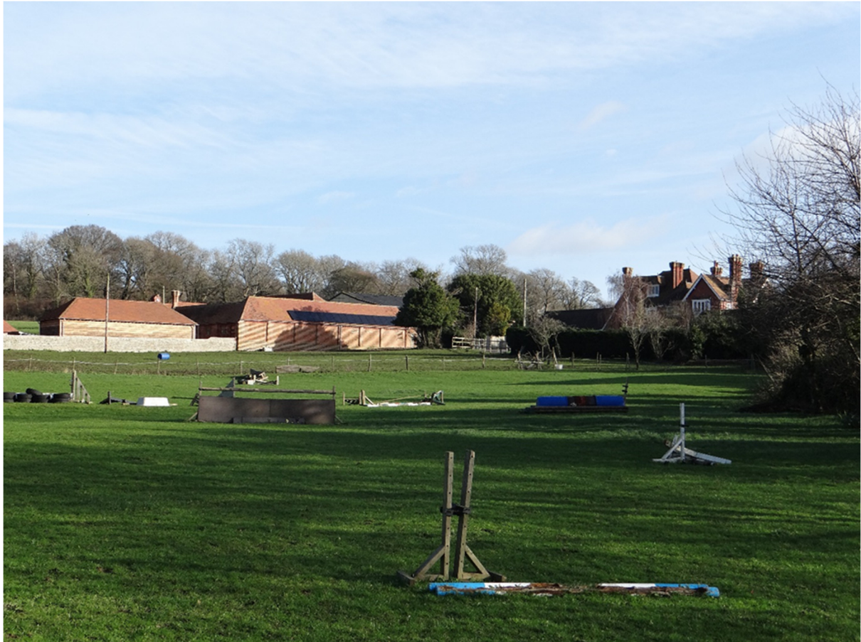
Tudor Barn and Clapham Lodge viewed across Church Field (C.Tomkins)

From this point and from the upper storeys of houses in the village there are excellent longer views to the sea to the south-west and south-east.