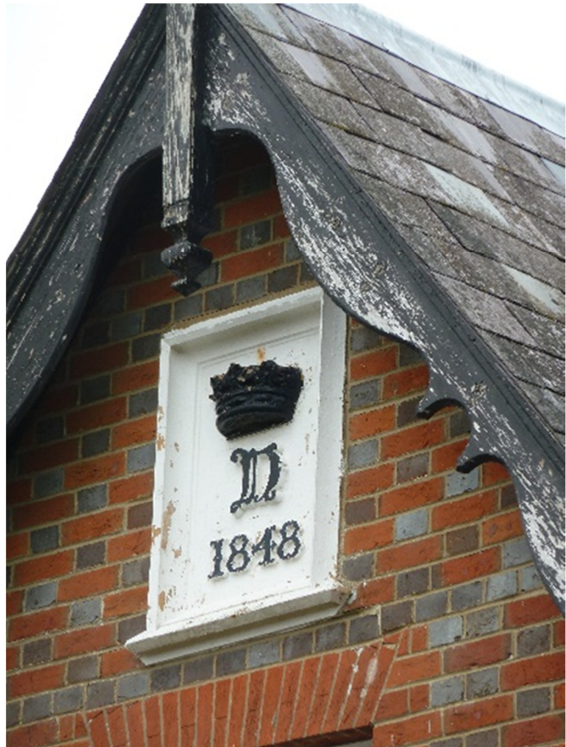
Norfolk crest on Holt Farmhouse (S.Morris)

The parish belonged to the Duke of Norfolk from 1827 (the Norfolk crest appears on the pairs of estate cottages, and on Holt Farmhouse); however, in 1874 an area in the east and south was exchanged with the predecessors of the Somerset family for land in the north of Patching parish, and the remainder of the parish was transferred to them in the 1920s (they built Somerset Cottages in The Street) - they remain the primary landowners today. The parish originally also included two detached parts to the North-West, containing Michelgrove House and Lee Farm; these were transferred to Patching and Angmering respectively in 1933.